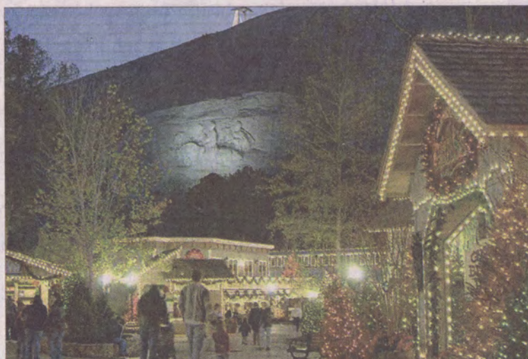
Stone Mountain Park

The Christmas season is already in full swing at Stone Mountain Park, with Santa Claus just one highlight of the offerings. Each activity-packed evening includes snow made by the Snow Angel, live entertainment, a marshmallow and hot dog roast over a bonfire, a Christmas 4-D movie, a holiday laser show and train ride, fireworks and a kids' land complete with "Caroloke." For the schedule and other information, call 770-498-5690 or visit www.stonemountainpark.com .